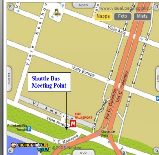
Shuttle Bus Service Meeting-Point Map

A Bus transfer from the nearest underground station EUR Palasport (M3 station of Line B) to CSM and vice-versa (15 min travelling) will be provided in the morning and at the end of the Workshop, in the afternoon, and to the Airport too. The Shuttle Bus meeting point is upstairs the underground station EUR Palasport , in Viale America, just in front of BELVEDERE Bar (departure from EUR Palasport-meeting point see the map). The bus will have a "CSM" plate on the front window.